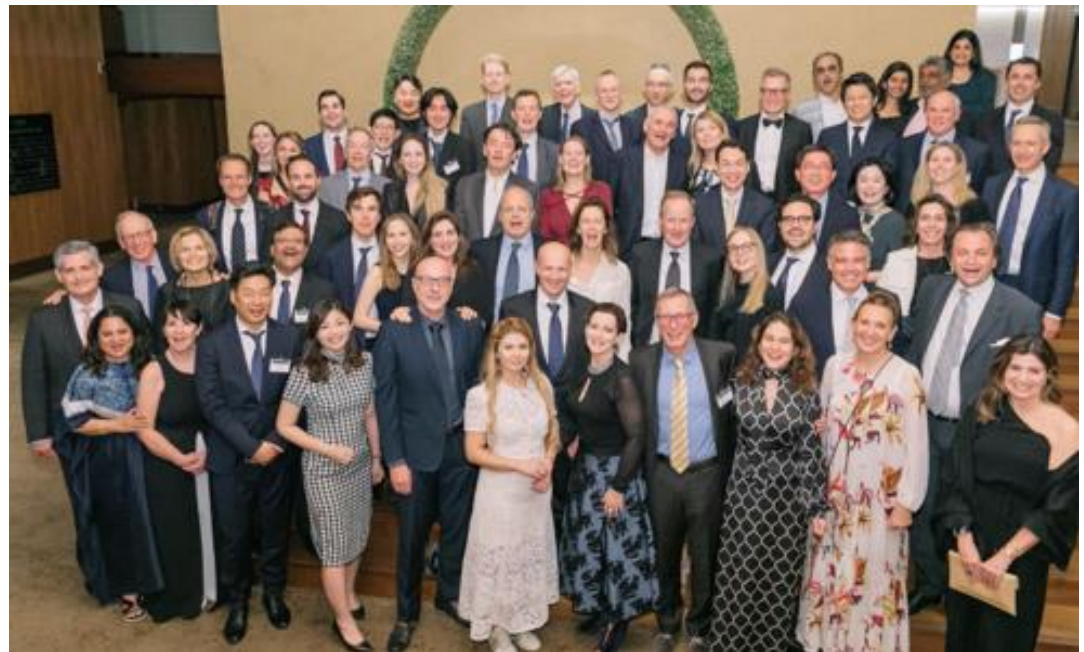
Globalscope Conference in Tokyo 2024

GLOBALSCOPE 55 independent M&A firms. 1 global family.