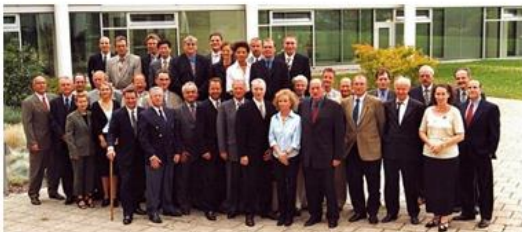
ACS meeting in 2001 in Mannheim, Germany